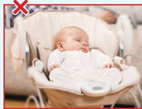
Infant seats, swings, strollers, sleep products that are inclined (not flat)