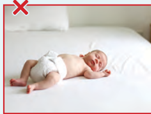
Alone on an adult bed