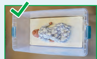
Bin (no lid)

For tips on making these temporary sleep spaces, and making a mattress, call your public health office or visit healthyparentingwinnipeg.ca .