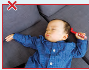
On a sofa