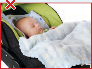
In a car seat or baby carrier