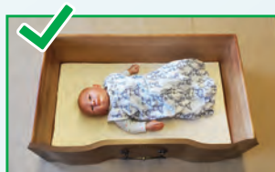
Drawer (not in dresser)