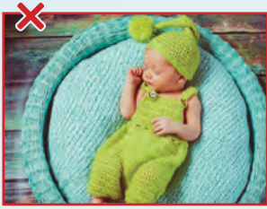
On soft surfaces such as a pillow or folded blankets.

Images with an ✖ are not safe sleep spaces. Sharing any sleep surface with your baby is unsafe.