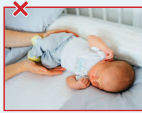
With a sleep positioner or bumper pads