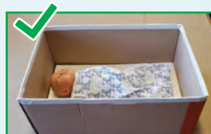
Box or Carton