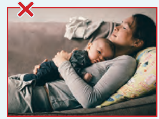
Sleeping with anyone on a sofa or chair