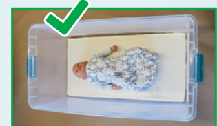
Bin (no lid)

For tips on making these temporary sleep spaces, and making a mattress, call your public health office or visit healthyparentingwinnipeg.ca .