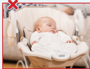
Infant seats, swings, strollers, sleep products that are inclined (not flat)