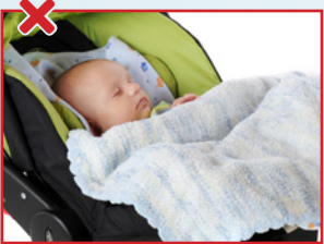
In a car seat or baby carrier