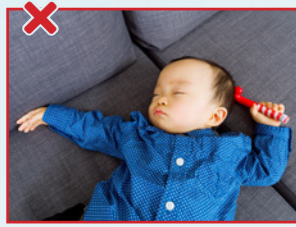
On a sofa