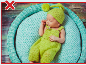
On soft surfaces such as a pillow or folded blankets.

Images with an ✗ are not safe sleep spaces. Sharing any sleep surface with your baby is unsafe.