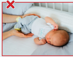
With a sleep positioner or bumper pads