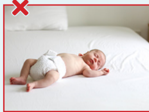
Alone on an adult bed